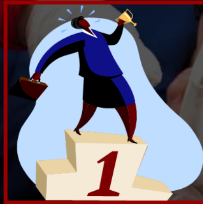
Damage to Reputation